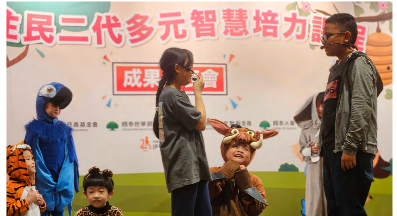
The drama class performed their parents' "cross-border" love story at the Result Presentation.