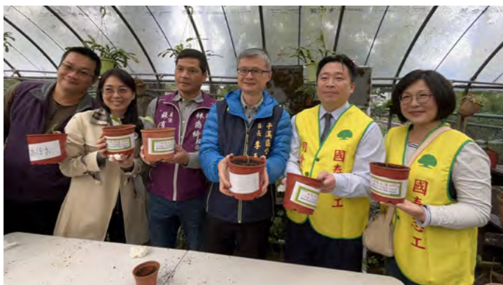
Cathay manager in Keelung, Pinghsi District Director and Principal of Pinghsi Elementary School grew the native plants together.

Award and the Elite Award in the 2023 national folk sports competition.