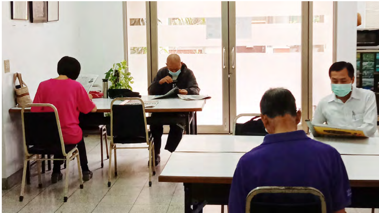
Located within neighborhoods, Lin Yuan Libraries serve a good place for people to read books and newspapers. (Neiwei Library)

Organized by: Cathay Real Estate Foundation