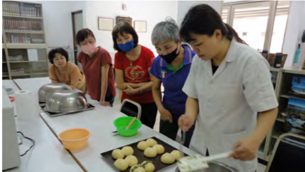
At the baking and cooking class held at Neiwei Library, participants kneaded doughs, sprinkled green onions on top and put them into oven, and finished the making of delicious bread.

For the year of 2023, Lin Yuan Libraries offered courses in children's art, flower clay art, baking, mosaic collage, color painting, etc. The handicrafts are of great variety. The moments in the class are filled with laughter, allowing students to grown their enthusiasm. They can make useful things based on their interest, creating beautiful and practical decorations.