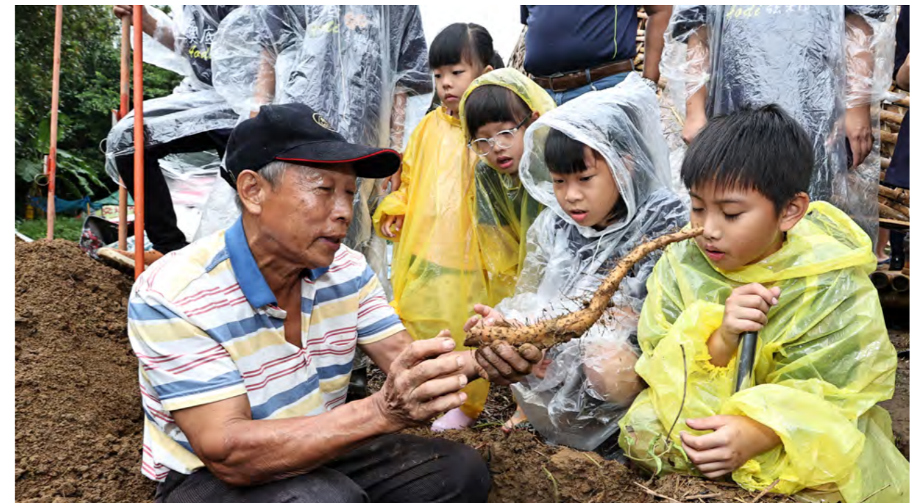
The elders at Shuangyu community explained the techniques of digging common yams to the children of Gongliao Elementary School.

Co-organized by: National Taiwan Ocean University