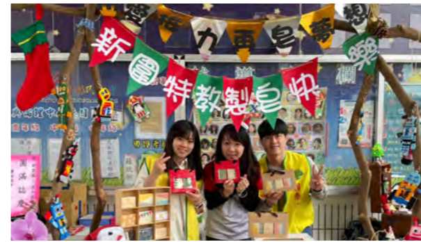
Cathay volunteers assisted the children from the special education program to sell soaps at school anniversary event.

"With Taiwan's 12-year compulsory education, we seek to unfold children's unlimited possibilities. Today's 'Three Schools in One