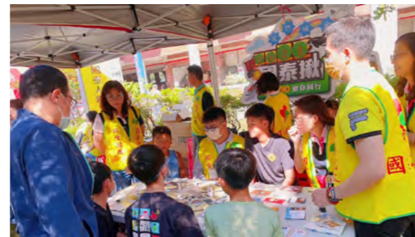
Cathay volunteer worked with local police to conduct anti-fraud event at the school anniversary of Liugou Elementary School.