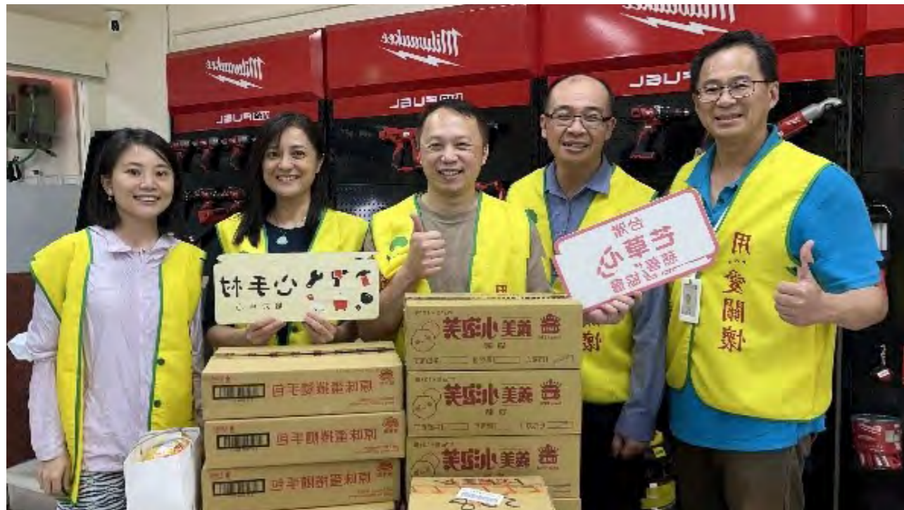
Cathay Life Insurance volunteers from liaison offices and Legal Office came to Homeless Taiwan Association to donate Ghost Festival offering goods.