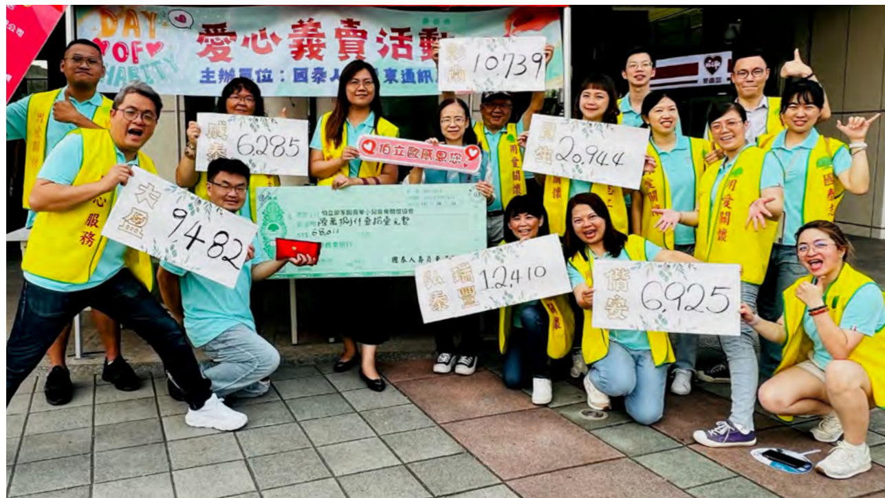
Cathay's Chuanyuantung Sub-team held blood donation and charity sale event. All proceeds were donated to Boliou to Polio Home.

Co-organized by: Cathay Real Estate Foundation