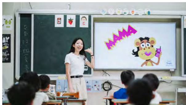
Cathay Financial Holdings has been a long-time supporter of Teach For Taiwan, recruiting, selecting, and training high-quality talents to work in high-need areas, providing the most needed resource for children — teachers.