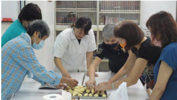
Participants were making croissants with excitement. (Baking class at Neiwei Library)