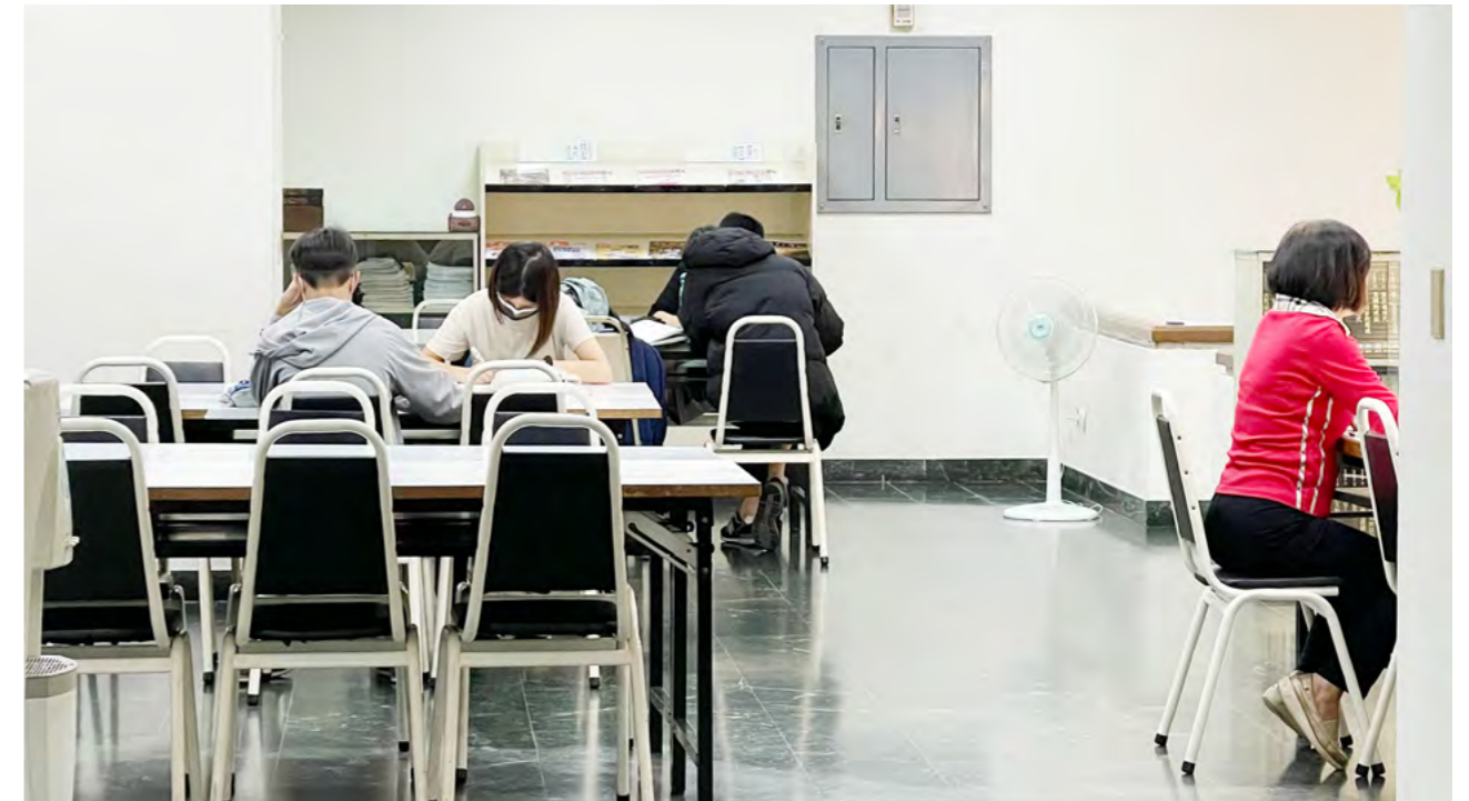
The library is in the proximity of the neighborhoods, good for near-by people to come to read papers and relax. (Lingya Library)

With the total floor area reaching 550 pings, each of the branches has a collection of more than 2,000 books, with topics ranging from literature, geography, children books, encyclopedia and etc. People get to read a lot of books, absorb knowledge, gain insight, and immerse themselves in the vast wisdom of the ancient and modern times, appreciating the enlightenment in words, and the timeless value brought by knowledge. Modern people are