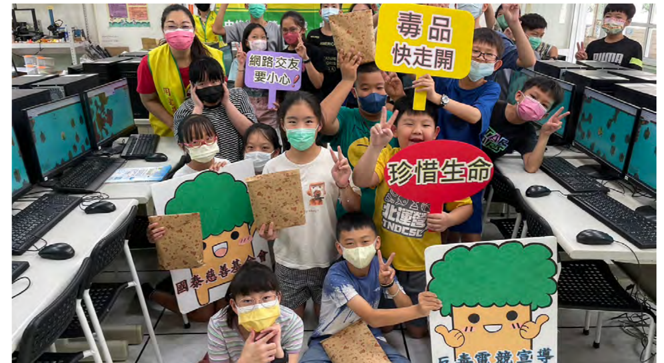
Cathay volunteers visited elementary schools and promoted the anti-drug awareness with PaGamO, the anti-drug game.

Co-organized by: Han Dong H.D.A., Against Wind Theatre and Cathay Life Insurance