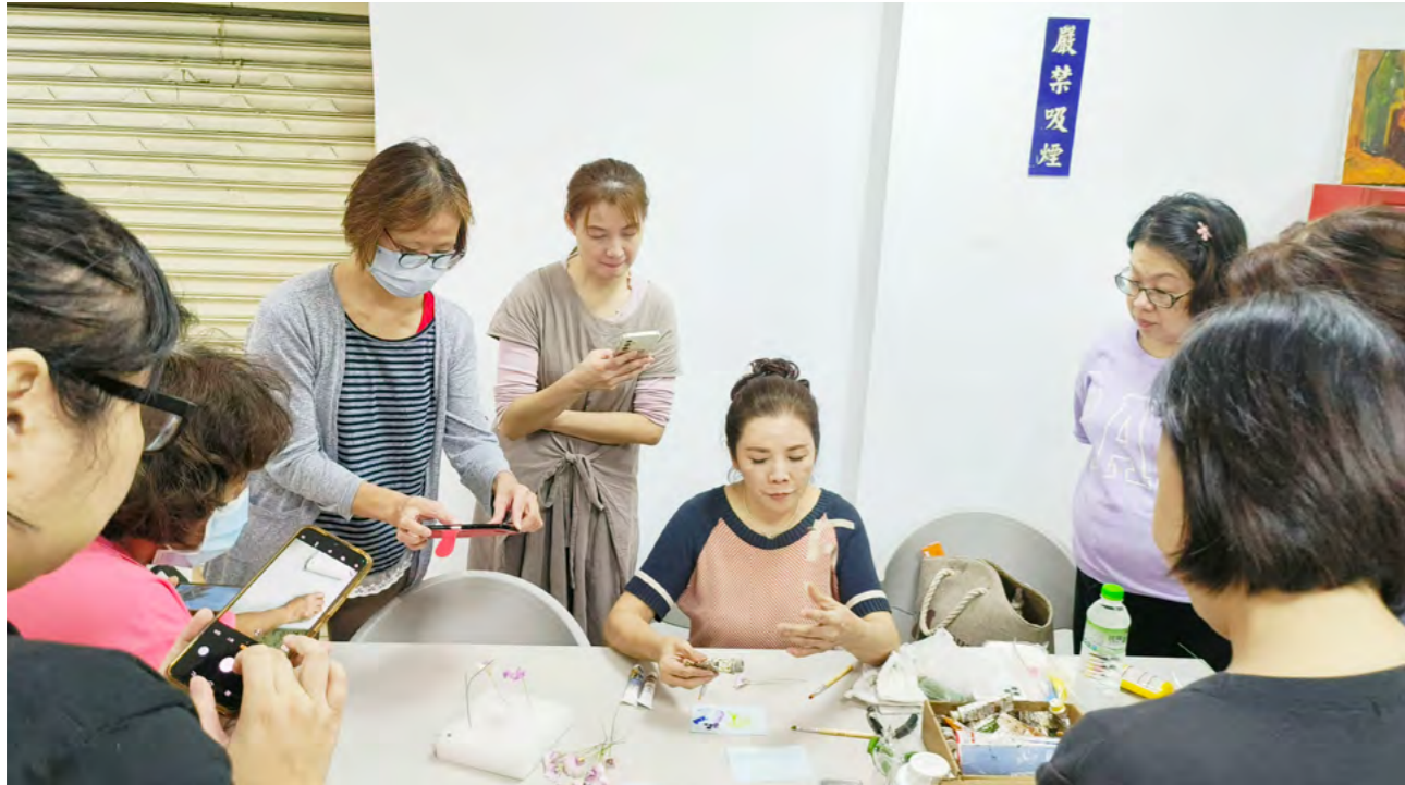
At the clay flower class held at Mingren Library, participants watched the instructor doing demonstration on how to do petals.