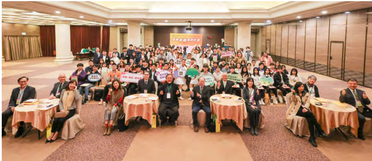
The Presentation Ceremony of Cathay Youth Excellence Scholarship took place at Cathay Financial Conference Hall on Dec. 21, 2023. Despite the cold weather, the award-winning youth's charity causes made people feel warm.

Organized by: Cathay Charity Foundation, Cathay United Bank Foundation, and Cathay Real Estate Foundation