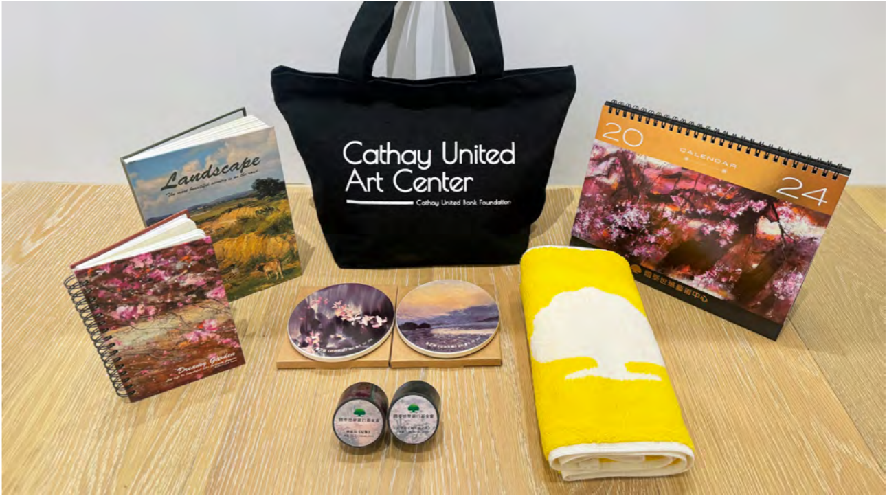
Art Calendars, Art Center tote bags, and sports towels for charity sale.

Organized by: Cathay United Bank Foundation Affiliate Art Center