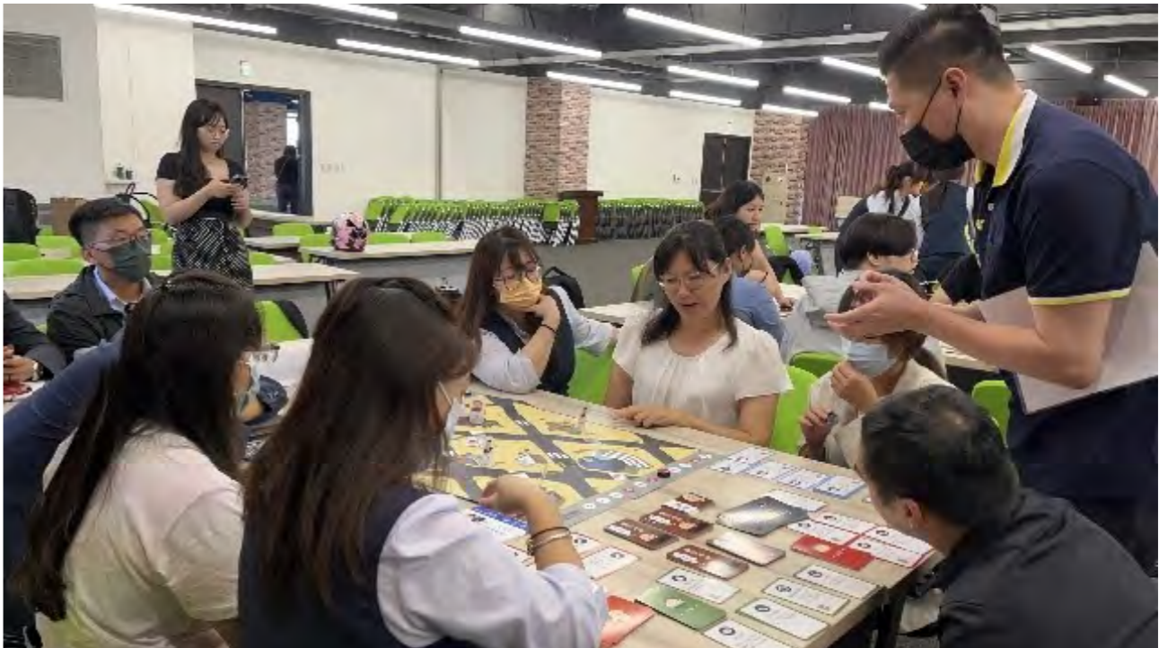
Cathay Life Insurance's volunteers assisted in the training workshop for anti-fraud board game at the training center in Wuri District, Taichung.

Taiwan is going to become a super-aged society in 2025. According to surveys, the three elements for elders to live a happy life include: health, social life and financial freedom. One should rely on financial freedom to maintain their basic needs in the senior life, which serves as the cornerstone of a happy life. People with higher financial freedom have relatively better health and social life. It is arguably true that one's financial condition is highly correlated to his physical health and social life. To this end, Cathay Life Insurance