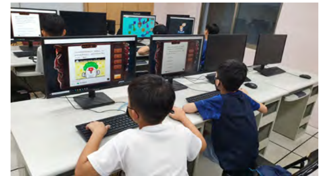
The online game PaGamO provides Q&A for 2nd generation immigrants to take on anti-drug challenge.

Furthermore, based on the consideration that some participants may have reached the legal working age under Labor Standards Act, the Program covered the subject of career exploration, in which participants received mock interviews for them to learn about the different stages of sending resumes and interviews, and also to protect them from scams.