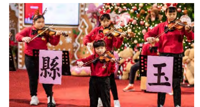
The performance of Yukuang Elementary School's children received warm applause from the audience.

For the charity event held by Taipei 101, the Foundation invited four Dream Project teams, one After-school Care class and two Cathay volunteer groups to provide performance with more than 250 students, parents and teachers participating. For those who needed to travel from places outside the Greater Taipei, the Foundation negotiated with Tamshui Training Center to provide accommodation. This activity allowed parents to accompany. In addition to great memories, this rare opportunity also brought cultural stimulation to children.