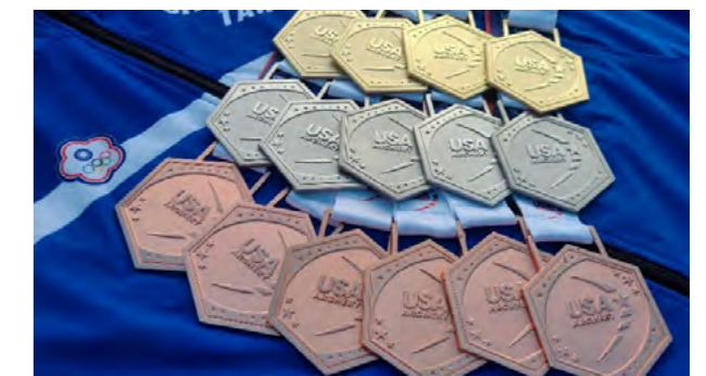
Sponsored by Cathay, Zhong-Hua Elementary School (in Hualien) won 4 golds, 5 silvers, and 6 bronzes in the 2023 USA Archery JOAD Target Nationals.

To improve children's capabilities through diversified learning, and to bridge the urban-rural gap, promote sustainable development and life-long learning, Cathay also sponsored the following projects: Green Island Elementary School's samba drumming program, Dinghu Elementary School's creative carpentry program, and Yuan Dong Junior High School's cultural writing class which aimed at preserving their hometown's beautiful memories.