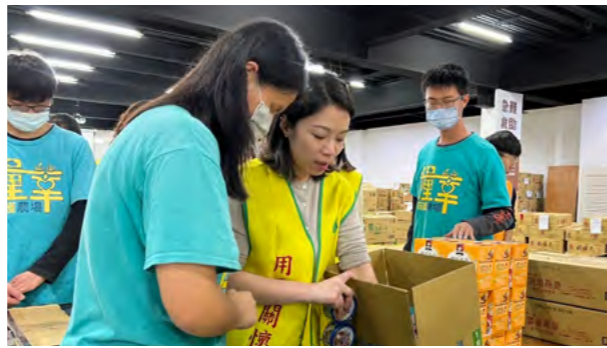
Cathay volunteers worked with the Hearty Farm members to pack the Andrew Charity Association's food boxes.

This is a project that Cathay's model volunteers joined hands with Basegarden, bringing the students from three schools together to have exchanges. Led by their principals and