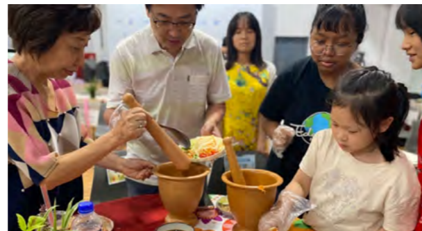
New Immigrant Cultural Market offered Thai style green papaya salad for people to experience exotic cuisine.

The 2023 event was the first time where the senior high school "Leadership Class" participants planned and organized a large activity "Love Without Borders" new immigrant cultural market. The market offered cultural color painting, toy design, food truck and drinks, all of which were completed by the 2nd generation immigrants. This market was held from August 26th to 27th at Tangbu Cultural Park in Wanhua District, Taipei, offering a dozen of booths selling exotic food (including Vietnamese, Malaysian, Indonesian, and Chinese food), hand-made projects, South-East Asian food truck and children's toys. Love Without Borders market attracted lots of people to experience the beauty of multiculturalism.