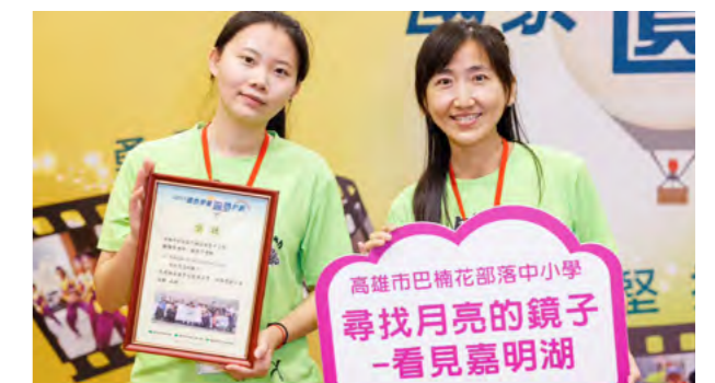
Led by their teachers, Padan Primary and Middle School's children hiked in the mountains and reached their destination Jiaming Lake successfully.