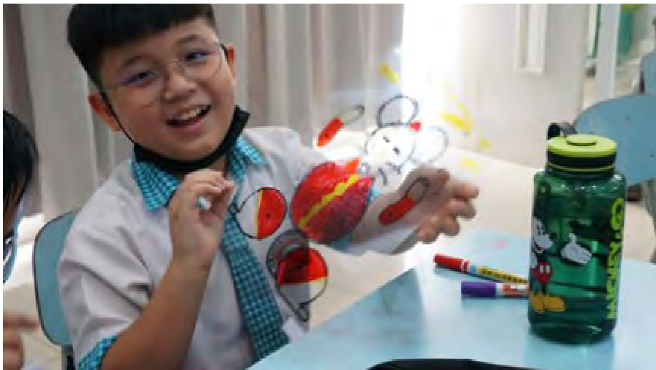
Soochow University's International Volunteer Team were teaching the children to make their own shadow play puppets.

Extending its care to remote country and new immigrant children, Cathay Charity Foundation worked with university clubs by sponsoring university clubs' winter and summer activities so as to pass on the Foundation's ideal to the next generation's young students.