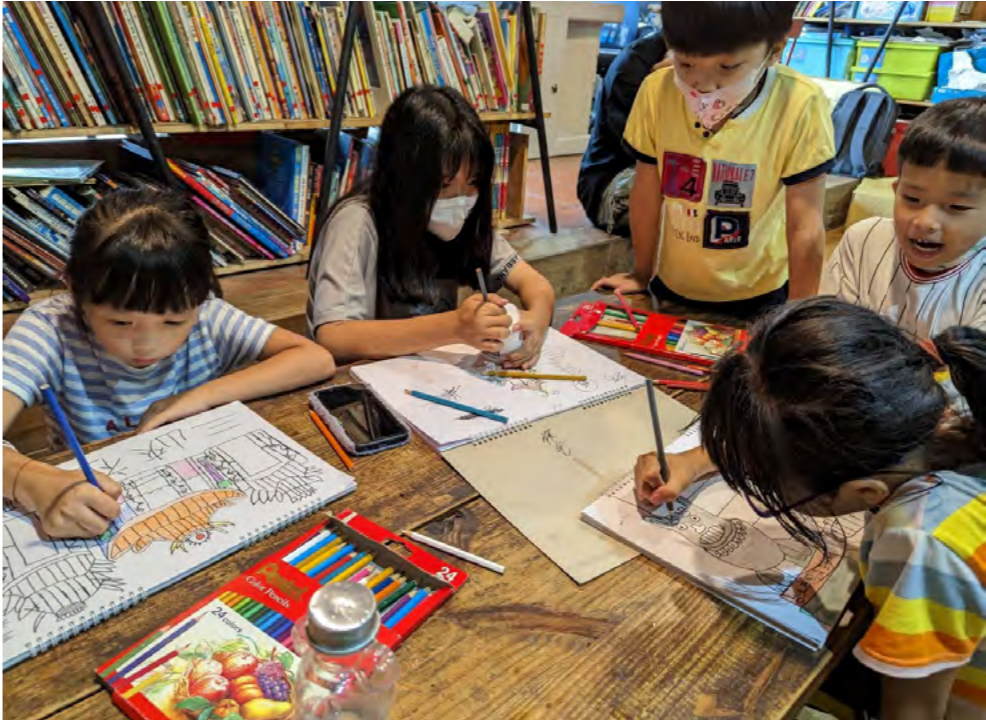
The art class at Little Grass Book House: for children to express the world they see and conceive through art.

Cathay has initiated After-school Care Program since 2011, and has gradually established long-term presence with Chongwen Women's Association in Oyster Shack Village, Yunlin, Let Love Fly in Shiulin County, Hualien, and Little Grass Book House of Sanxia in New Taipei City. These After-school Care Programs aimed at providing a place for those children who suffer from poor academic performance due to family or financial issues. The 2023 funding that Cathay provided in this regard was NT$ 1.5 million (US$ 48,749), benefiting 101 children.