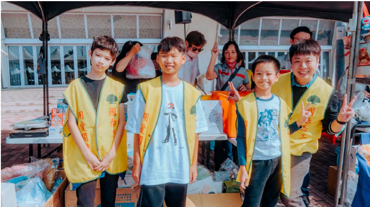
Charity Bazaar in Kaohsiung: Cathay volunteers brought their children, friends and relatives to support the event.

Organized by: Cathay Charity Foundation Co-organized by: National Police Agency and local police stations