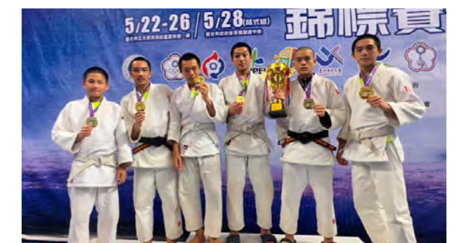
Sponsored by Cathay, Jianshi Junior High School won 1 gold, 3 silvers, and 2 bronzes at the National Judo Tournament.