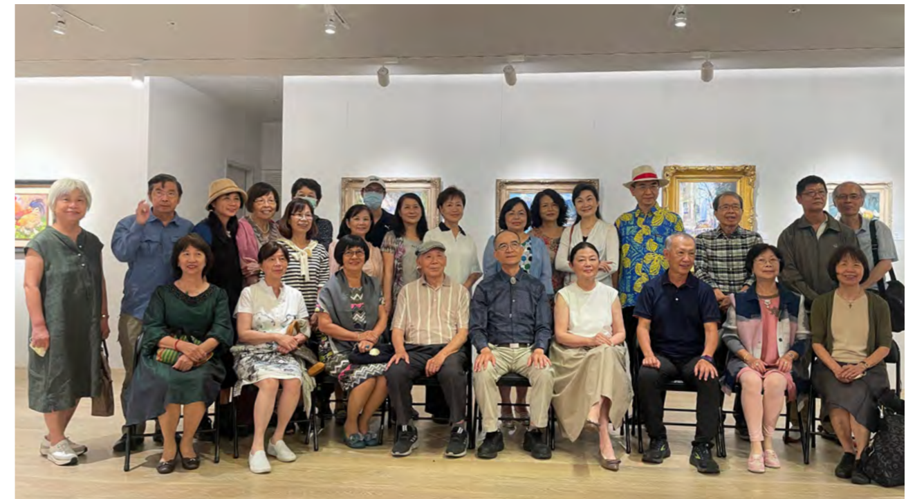
The participating artists from Yuan-Shan Painters' Association took a group photo with guests and friends.

Organized by: Cathay United Bank Foundation Affiliate Art Center