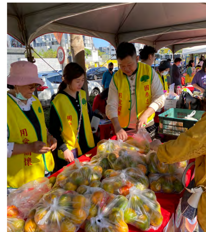
Charity Bazaar in Taichung: the oranges raised by Cathay volunteers were sold out within two hours.

At the two sessions of Charity Bazaars, the staff at all Cathay subsidiaries took the role of volunteers, working hard to raise goods for charity sale. After the deduction of administrative cost, the two events raised and donated NT$ 650,000 (US$ 21,124) and NT$ 500,000 (US$ 16,250) to YMCA Taichung and YMCA Kaohsiung for the causes of supporting the under-privileged children in these two areas, which is in line with Cathay's "empowerment" spirit among its three major sustainable goals.