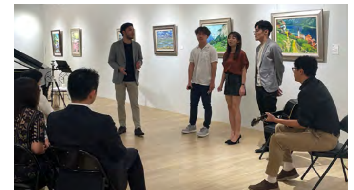
Live performance of Art & Music Salon.

In order to promote art education, the Art Center conducted Art Talk Lecture Series for free during the evening time at the venue. The Art Center invited Chairman of The Oil Art Society of the Republic of China Yung-Fu Yang and Chairman of Taiwan International Watercolor Association Ren-Shan Lin to give lectures of five sessions. The Art Center also organized two lectures for exhibitions and two music concerts, hoping to provide the general public with the access to art education and attract people to appreciate art.