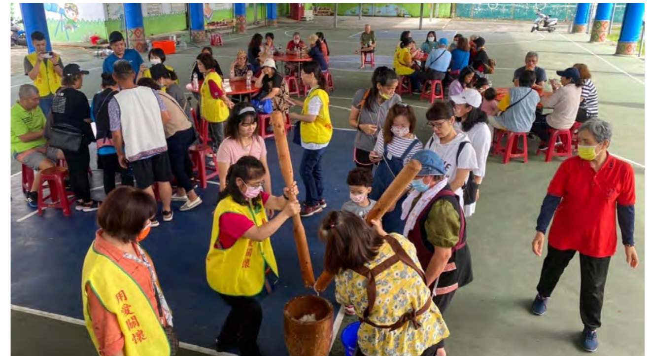
Cathay volunteers and the elders at Wenlan Tribe worked together to make bamboo tube rice.

Co-organized by: Wenlan Tribal Cultural Exchange Association and Andrew Charity Association