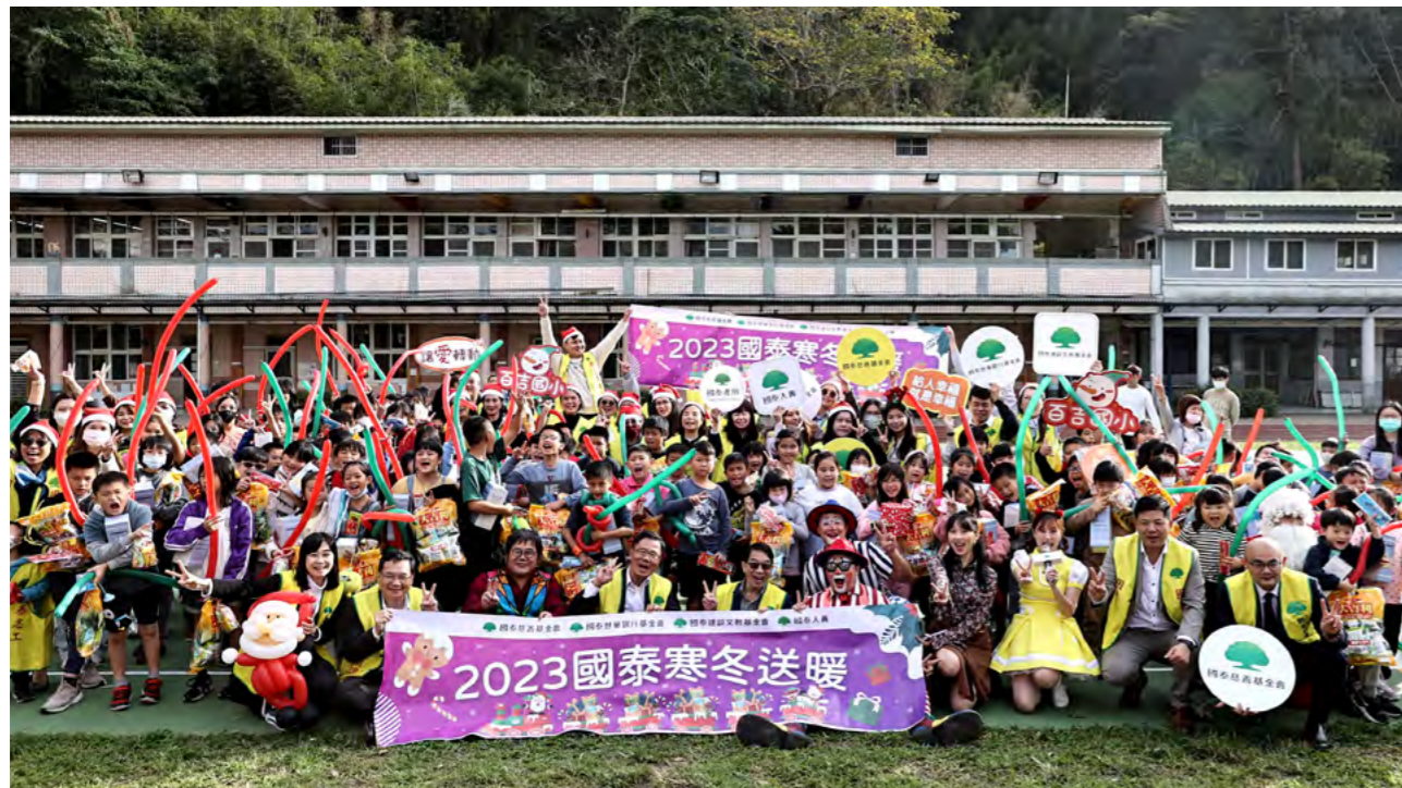
The Winter Warmth Program event was held at Baiji Elementary School in Tahsi District, Taoyuan, bringing fun and laughter to the teachers and students there.

Co-organized by: Cathay United Bank Foundation and Cathay Real Estate Foundation