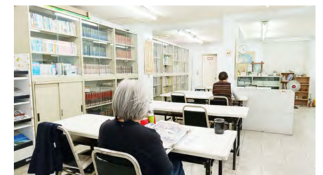
The library is spacious and bright, a good place for people to read books and magazines comfortably and leisurely. (Yunong Library)

busy and tired, seeking speed in everything. They are under great pressure and have a restless mind. The library is integrated into life, providing peace and comfort and away from the hustle and bustle. It can take a break and retreat in the busy life, so that the tense nerves can be released. Reading a good book would clear one's mind, bringing satisfaction and refreshed thought. The library is like a tranquil garden where one can settle their soul.