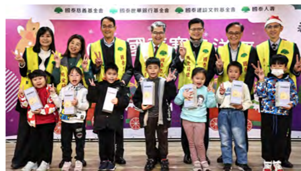
Cathay's senior leaders joined the event at Sanho Elementary School in New Taipei City, spending a great time with the children together.

Cathay Financial Holding Group and its subsidiary companies have actively participated in the Program for the past 22 years. For the 2023 event, Chairman of Cathay