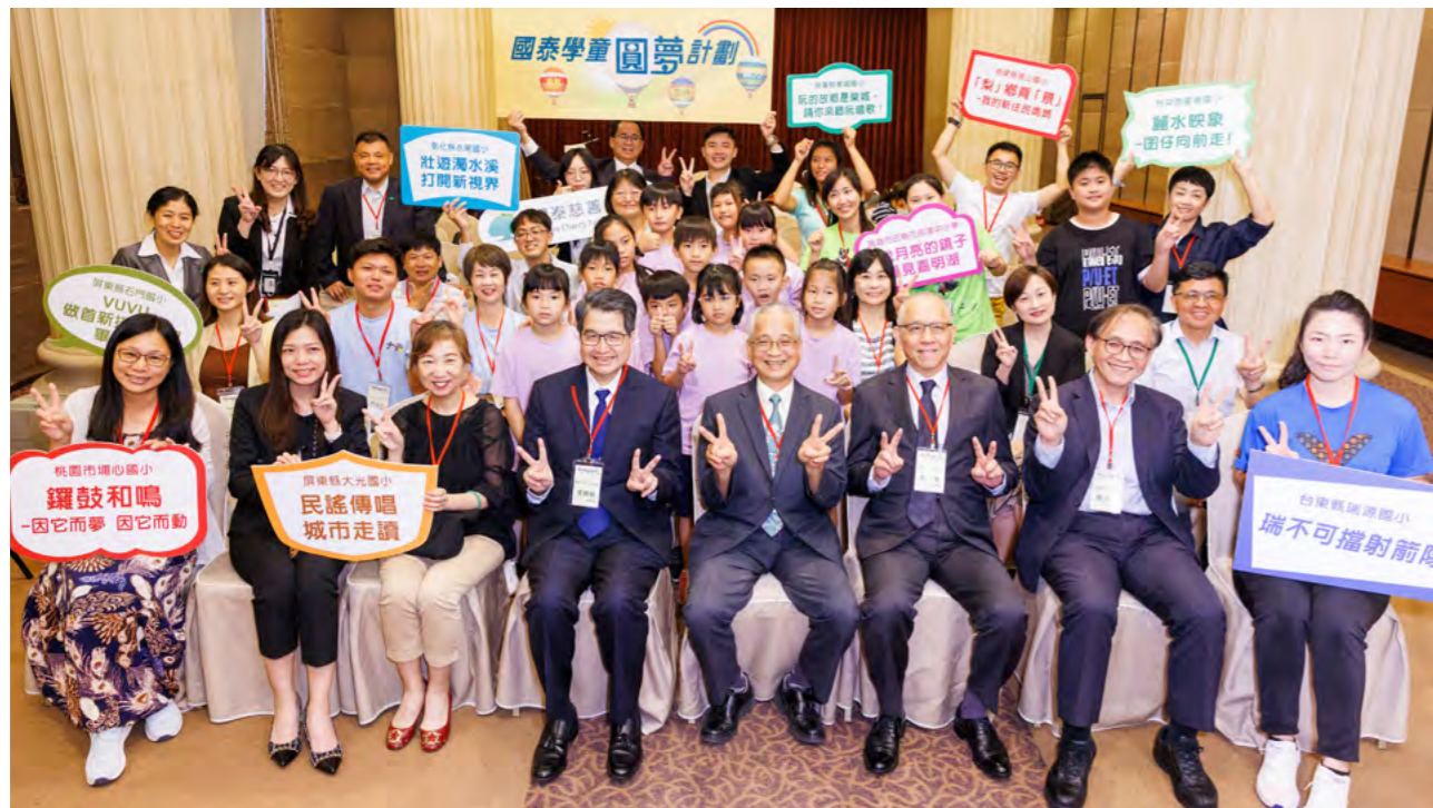
The Dream Come True Documentary Award aims at encouraging the students at the remote country to pursue their dreams.

Organized by: Cathay Charity Foundation, Cathay United Bank Foundation, and Cathay Real Estate Foundation