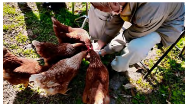
The social workers at Happy Farm shared the eggs with the child care to alleviate the problem of egg shortage in the market.

Cathay Happy Farm focuses on the "physical, mental and financial" health of community elders. Through the way of industry-academia collaboration, Wenzai Village of Tungshi Township reconstructed the local cultural history with local people by recreating the traditional black gram soy sauce. This has built a foundation for local regional revitalization and regenerated the communities.