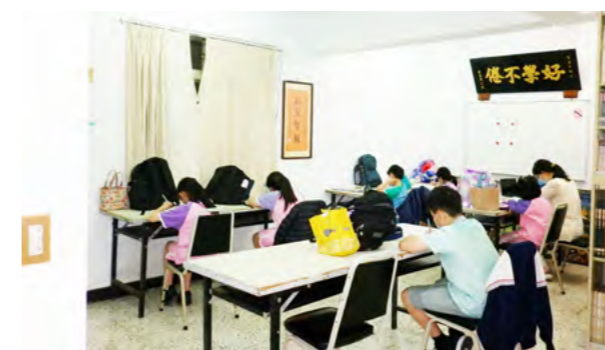
The library is a good place to get new knowledge and to be away from the hustle and bustle. (Banciao Library)