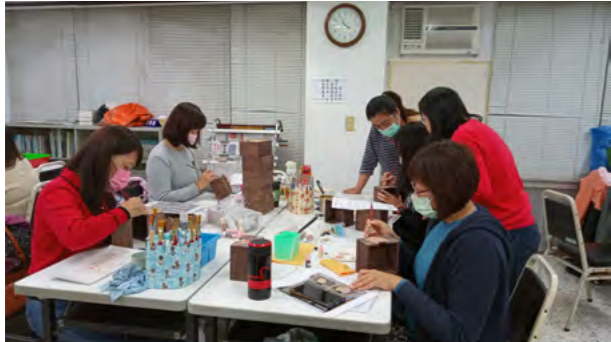
At the color painting class held at Sinjhuang Library, participants attentively layered pigments on to the pattern to create delicate texture like oil painting.