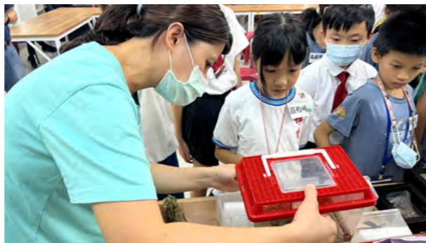
Baoshan Elementary School's teachers and students explained the growing process of beetles to the students from Songshan and Boai Elementary Schools who came from afar.

directors, the children of Boai Elementary School and Songshan Elementary School came a long way from Taipei to Baoshan Elementary School in Hsinchu County. The teachers and children from the three schools spent a day doing lots of activities.