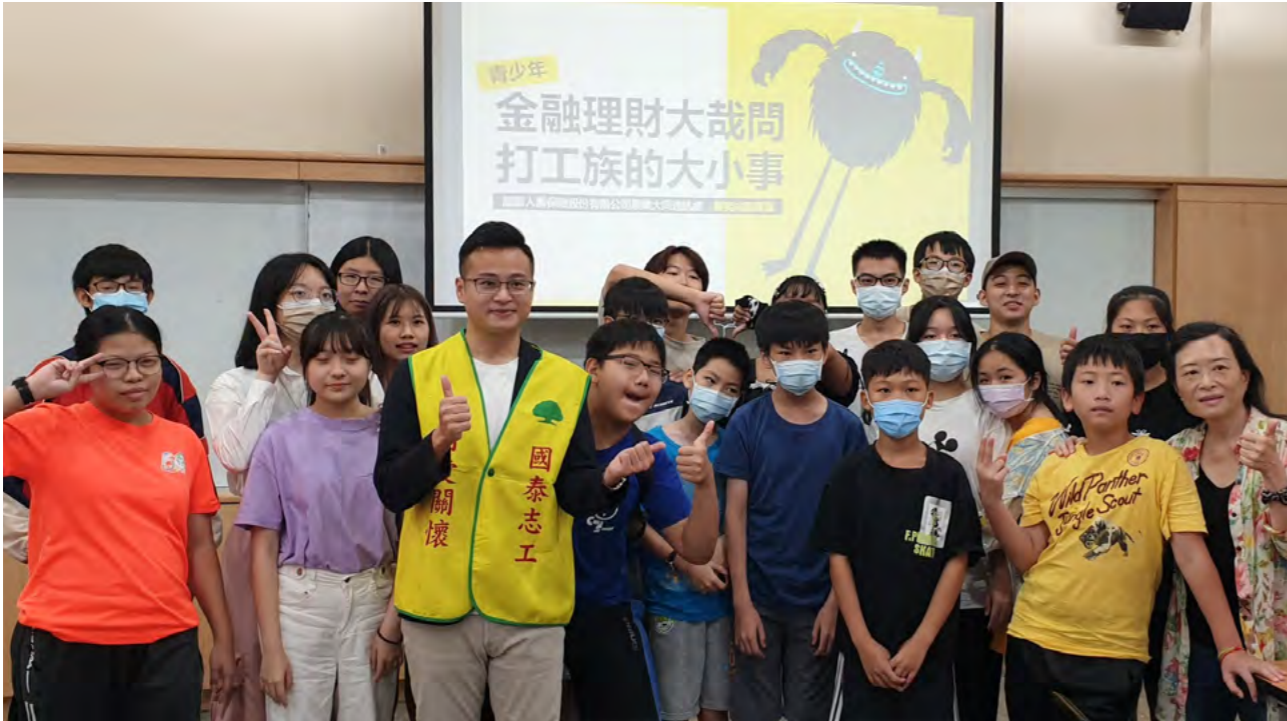
Cathay volunteers provided custom-made financial and career education courses, reminding participants to protect themselves from scams.