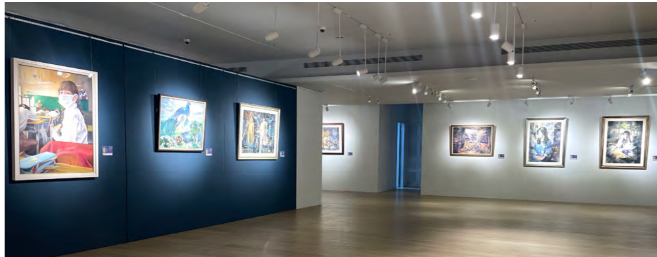
The venue of 2022 Cathay Arts Festival- Emerging Artists Exhibition.

Organized by: Cathay United Bank Foundation Affiliate Art Center