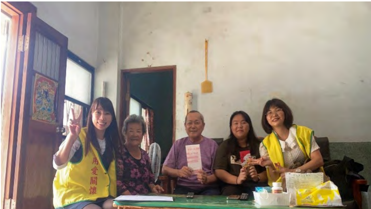
Cathay volunteers called for their colleagues to support disadvantaged student to be able to go to school.

Every year in Taiwan, numerous families suffer from distress due to natural disasters, major illness, or accidents, which put their life and economy into immediate difficulties. In order to help them weather the storm, the Foundation, since 2009, has extended a helping hand through Cathay volunteers who pay visit and support for them to get over difficulties. At the Foundation, we hope that the volunteers' visits would help them get through the valley of darkness as soon as possible.