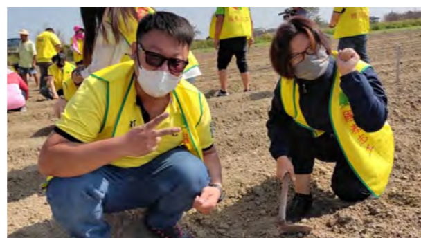
Cathay volunteer grew black gram with the elders in the fields and the harvest would be used to make soy sauce.