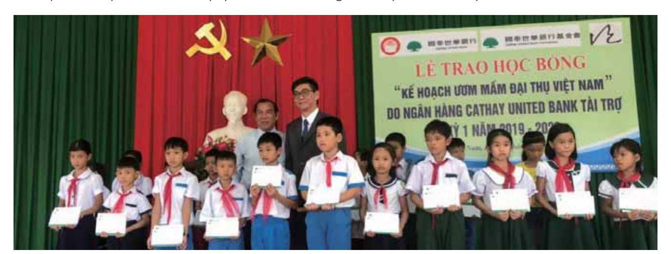
國泰世華銀行與國泰世華銀行基金會共同推動《越南大樹計畫》,跟隨銀行發展腳步前進越南,13年來已幫助 1.7萬名當地清寒學童求學圓夢。 Cathay United Bank and Cathay United Bank Foundation jointly held the Elevated Tree Program in Vietnam which had supported 17,000 school children for 13 years.

Cathay United Bank Foundation has devoted itself to the welfare of children and youth education, underprivileged communities in the remote country and the promotion of art and cultures. It will continue to fulfill its corporate responsibilities and pay the kindness and generosity to the society.