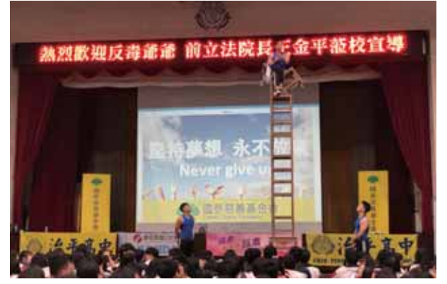
由撼動 HDA 團隊以生動活潑的表演結合反毒宣導活動,引起高中生熱烈共鳴。

Mixed Disabled Troupe gave performance at Lioujia Junior High School. Students shed tears for their stories.