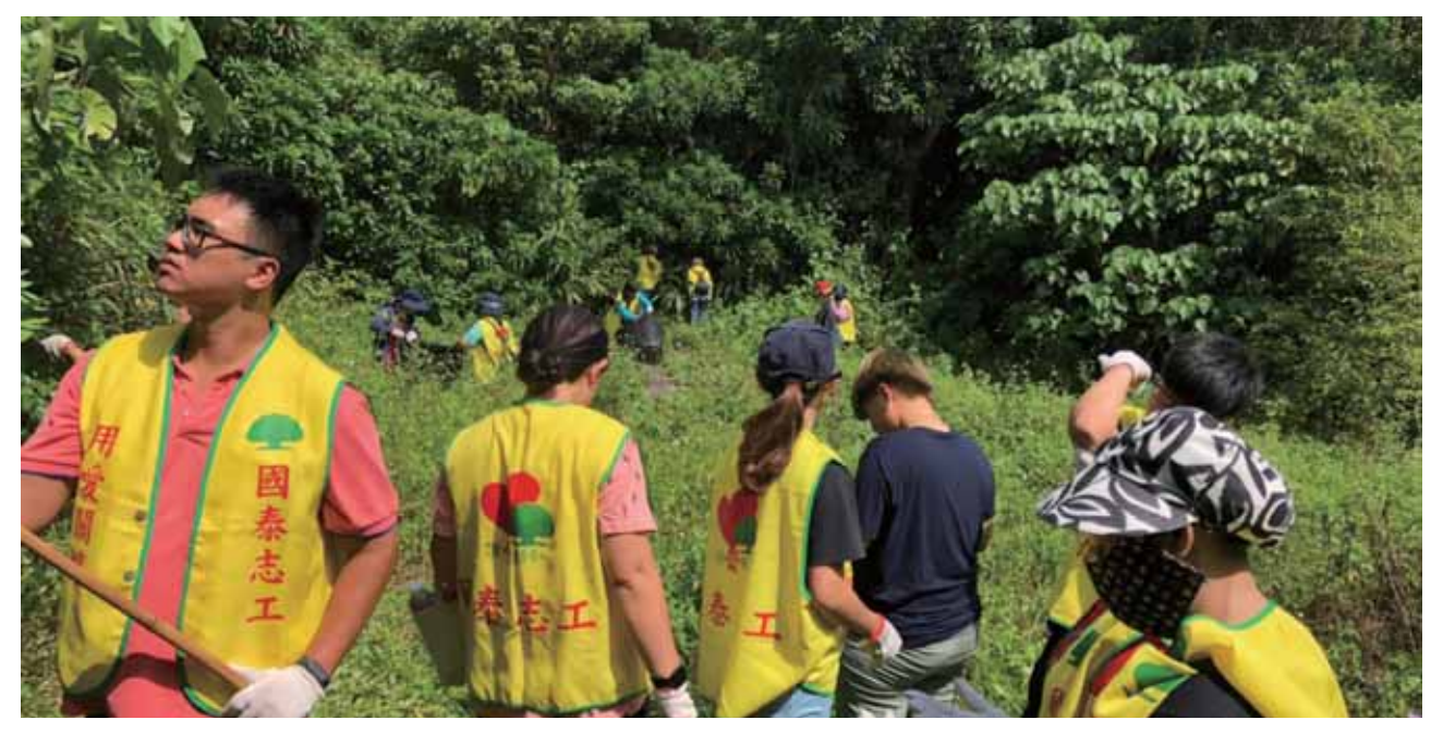
展礁溪分隊志工參加小花蔓澤蘭摘除活動,動手清除綠癌。 Volunteers from Zhanjiaoxi Team joined the activity of green cancer removal.