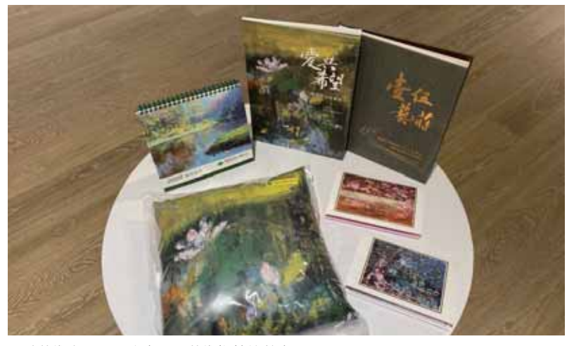
設計藝術桌曆、展覽畫冊、藝術抱枕等義賣品。 Art albums, calendars and cushions for charity

2019年國泰世華藝術中心以「盡善盡美」為主題,精選12位藝術家一王守英、陳輝東、籍虹、蘇憲法、楊永福、葉繁榮、溫宗益、簡昌達、黃進龍、李正郎、林榮與楊淑惠的作品製成年度桌曆。期盼在嶄新的一年,藝術作品能為社會大衆的生活增添色彩,並帶來閒適靜謐的舒暢心境。同時也出版「愛與希望」展覽畫冊、以及藝術抱枕等藝術商品持續義賣,所得全用於幫助弱勢學童,致力發揚社會良善之美。