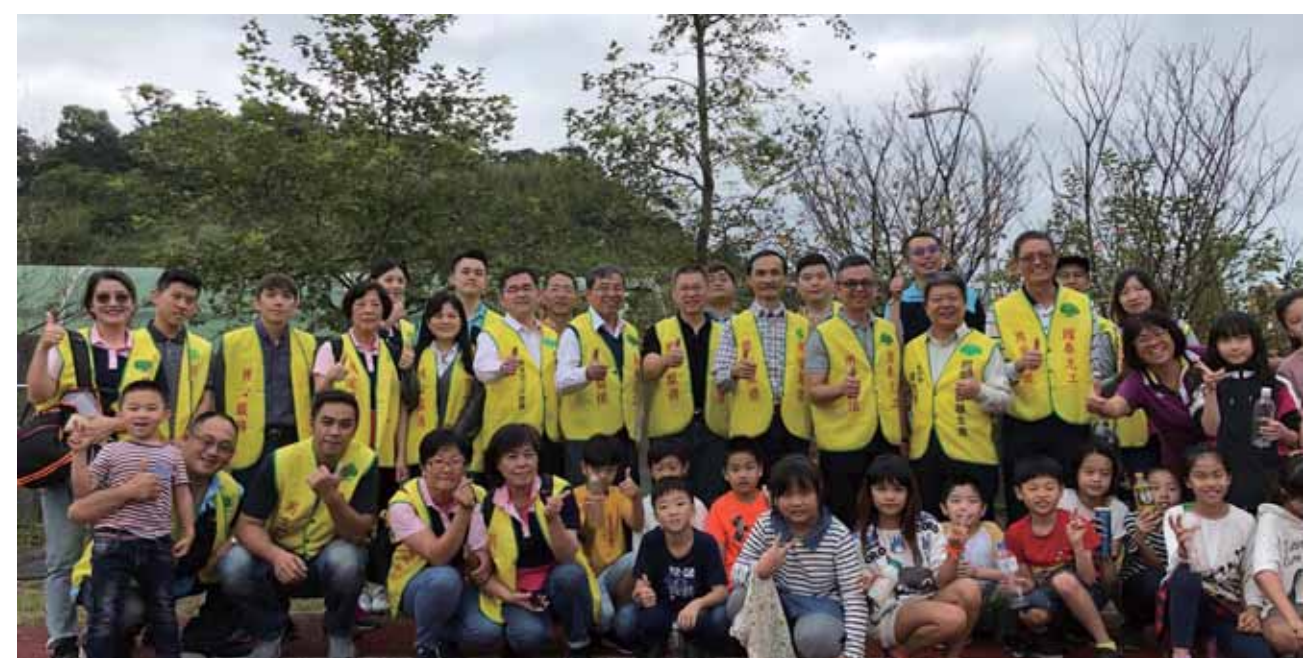
『2019 校園植樹嘉年華活動』 10/23 在基隆武崙國小舉行,集團主管及志工同仁與師生們合影。 Cathay managers and volunteers joined the 2019 Tree-planting Festival held at Wulun Elementary School on Oct. 23rd.