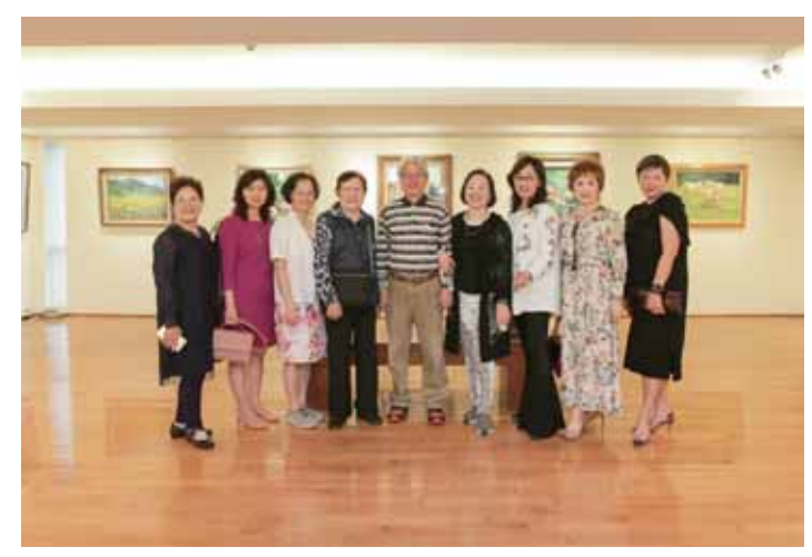
「四季之歌 I 快樂行 十人聯展」展出藝術家共同合影。 Featured artists took a group photo at the Joint Exhibition of 10: Songs of Four Seasons I

因為這份熱忱,讓每一幅畫都有了生命,「四季之歌 快樂行十人聯展」帶領觀者遊歷屬於他們的内心藝術世界,同時也呈現他們一年四季最珍貴的快樂成果。