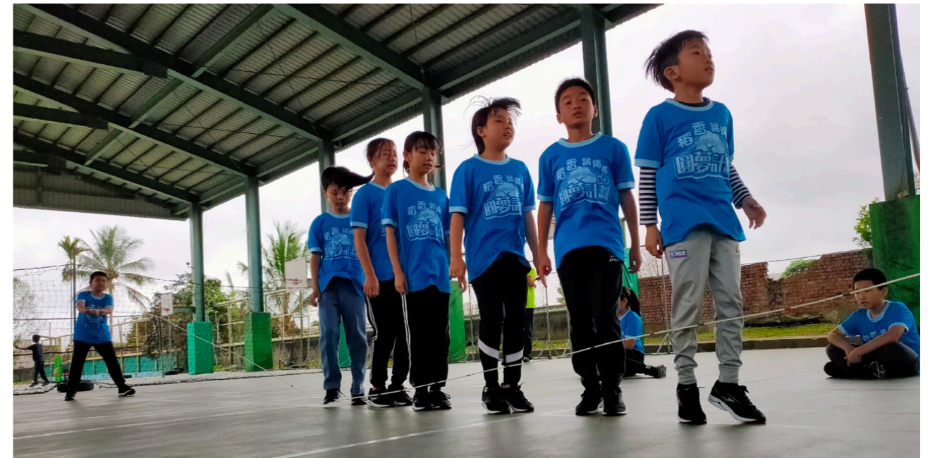
Daoshiang Primary School's rope skipping team won a national competition's Excellence Award in group challenge.

Money problems can occur when new payment methods keep emerging. Money traps are everywhere but people's materialism doesn't dwindle. Cathay believes establishing right attitudes about money and finances is the key to help the children living in remote country address such challenges without stumbling. That will become an important