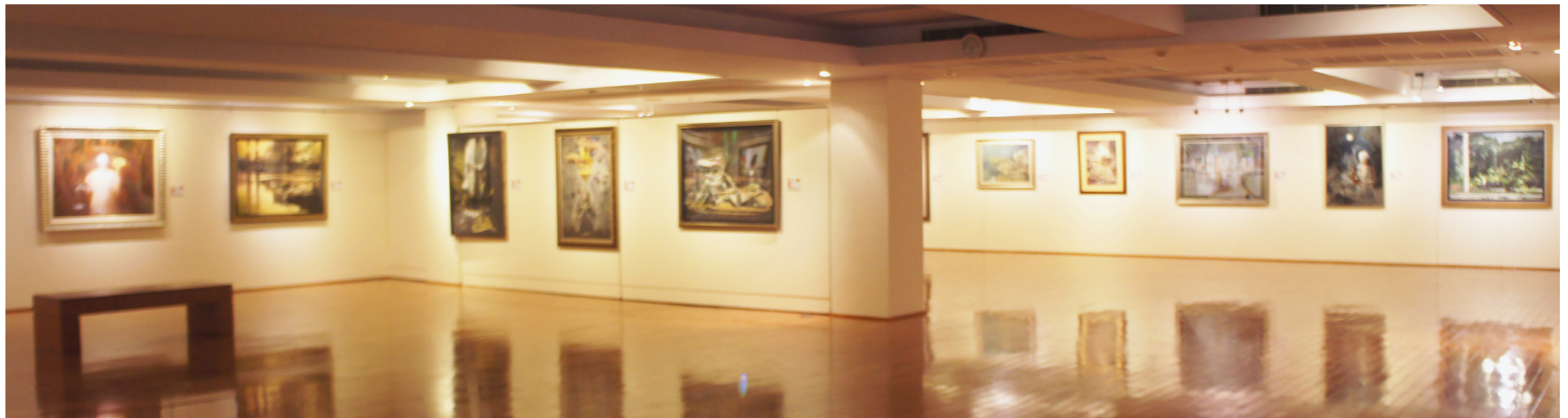
A scene from the 2019 Cathay Art Festival- Emerging Artists Exhibition.

more people to appreciate. The participating works were exhibited at Cathay United Art Center starting from January, 2020, for people to know more about these young artists of Taiwan's next generation.