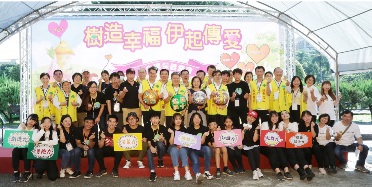
Senior managers from Cathay Charity Group attended the charity bazaar.

Organized by | Cathay Charity Foundation Co-organized by | Cathay United Bank Foundation and Cathay Real Estate Foundation