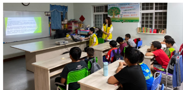
Volunteer instructors from Cathay United Bank's Hualien Branch taught children about the concept of saving.

mium environment and build their self-esteem so that they can take on a life journey full of hope and dream.