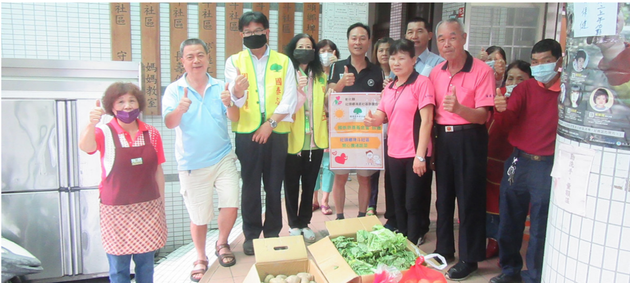
The Cathay Happy Farm at Nandi shared harvest with local social welfare organizations.