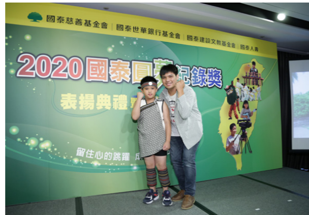
Students from Yisheng Elementary School repaired traditional Atayal instruments and reproduced the sounds of "Xiao Wulai" with African drums.

In order to boost the positive energy and fine educational ideas, Cathay Charity Foundation launched the Dream Come True Documentary Awards in 2020, encouraging Dream Come True Program's teachers to keep a record of their Dream Come True projects in words and in images. For the first year, 7 elementary schools were granted with the awards and the total prize money exceeded NT$ 200,000 (US$ 7123). The winning works presented plentiful educational passion and power in a wide variety of themes.