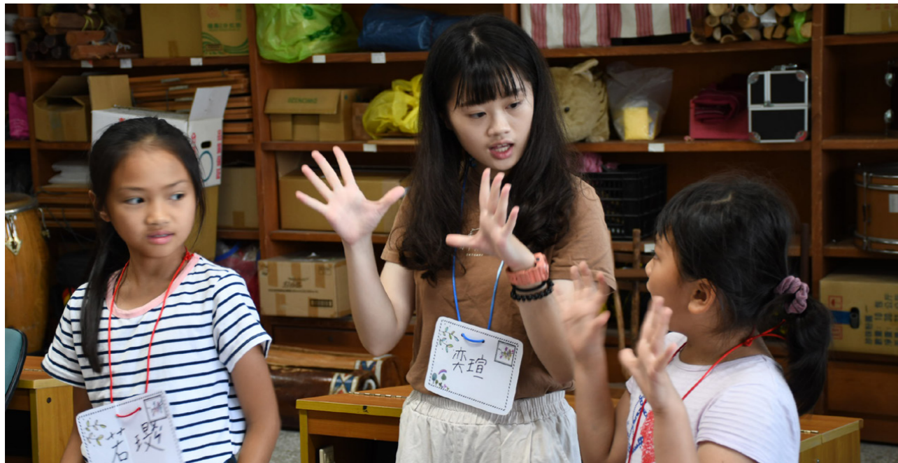
Chengchi University's students were teaching children about the course.