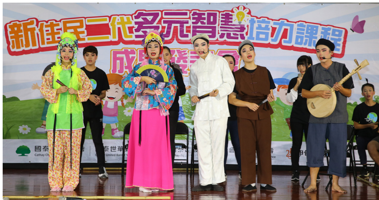
Students from Leadership Program wowed the audience by playing Taiwanese Opera that they learned from community services.