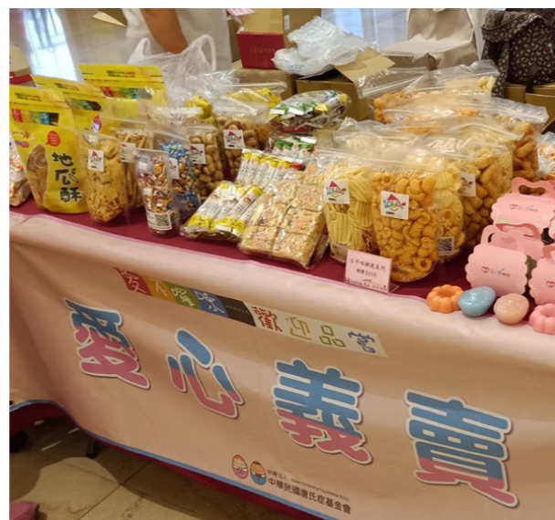
There were lots of product for sale at Down Syndrome Foundation's booth.

Down Syndrome Foundation's Hand in Hand Street Festival was originally scheduled to be held on March 21, the World Down Syndrome Day, but out of COVID-19 concern it was postponed to Nov. 29, just days before the International Day of Persons with Disabilities, at Chianti Avenue Plaza in Xinyi District. In the Festival, the popular band Egg-PlantEgg took the role as the Festival Ambassador and played a lot of songs for the participants. People with Down Syndrome in costume marched with the crowd from Chianti Avenue and passed through