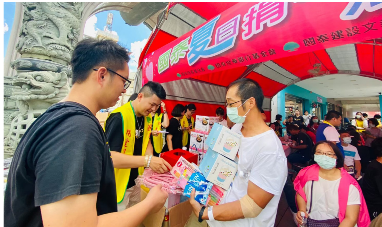
Blood donation was much needed during the pandemic.

Co-organized by | Cathay Real Estate Foundation