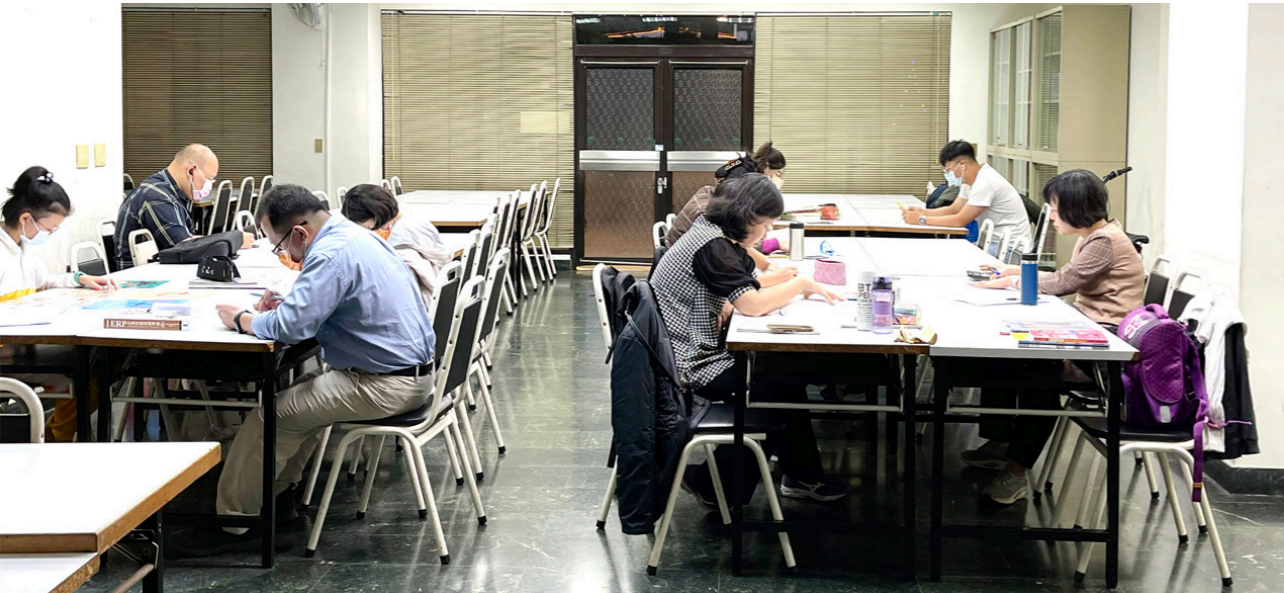
Bright, spacious, and quiet, Lin Yuan Library has become part of the community life. (Lingya Library, Kaohsiung)

Organized by | Cathay Real Estate Foundation