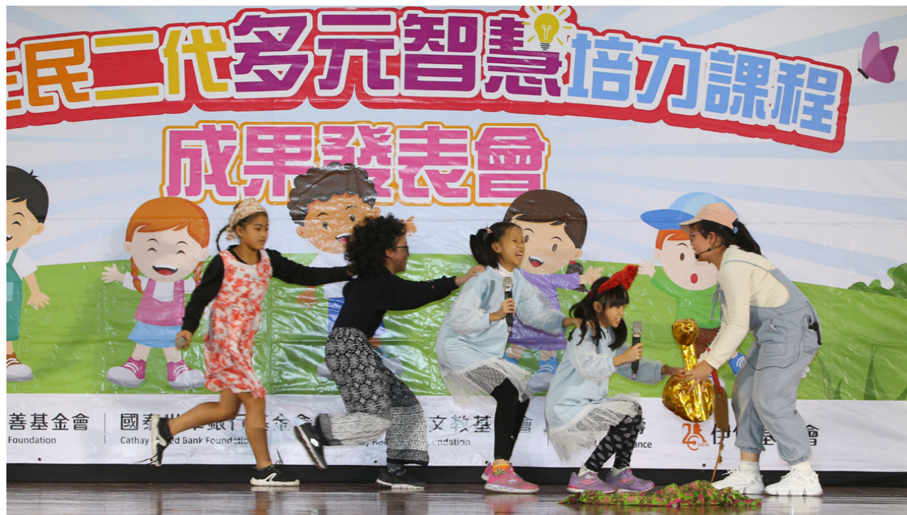
Students from Theater Program confidently played folk tales of their mothers' home countries.

Co-organized by | Cathay United Bank Foundation and Cathay Real Estate Foundation