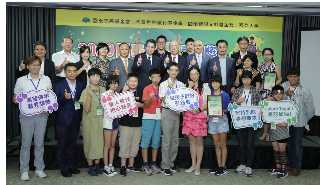
At the 2020 Dream Come True Documentary Award Ceremony, Chairman of Cathay Charity Foundation Fredrick F. Chien (5th from right, middle row), Chairman of Cathay United Bank Foundation Roger M. H. Lee (6th from left, middle row), Chairman of Cathay Real Estate Foundation Ching-Kuei Chang (4th from right, middle row), took group photos with the guests and award winners

Organized by | Cathay Charity Foundation