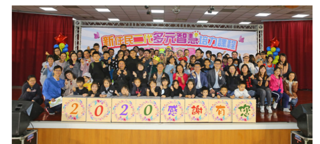
Students, parents and guests took group photos together.