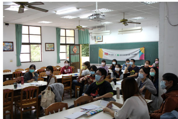
DFC beginner's workshop on teaching and guiding techniques.