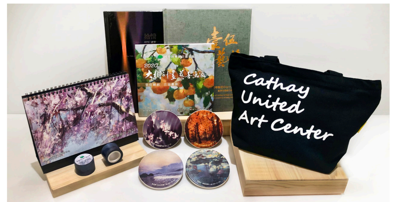
Art calendars, Charitable Exhibition Art Album and products for charity.