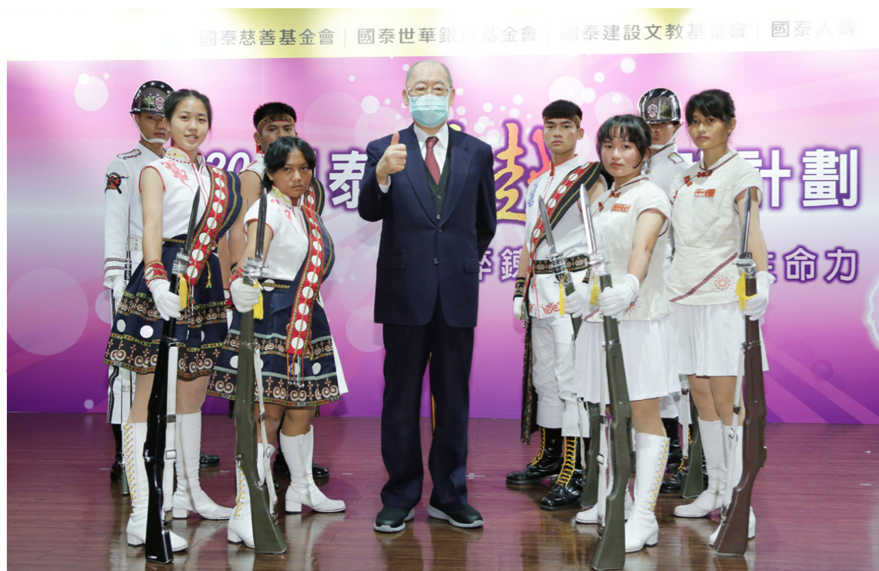
Neipu Vocational School's color guards moved a lot of people to tears by their stories of fighting for changes against all odds. Chairman of Cathay Charity Foundation Fredrick F. Chien (central) took a photo with them after the ceremony.

Organized by | Cathay Charity Foundation, Cathay United Bank Foundation, Cathay Real Estate Foundation