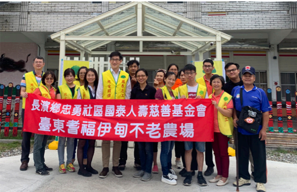
The third Cathay Happiness Farm was established in Changbin Township, Taitung.

Organized by | Cathay Charity Foundation