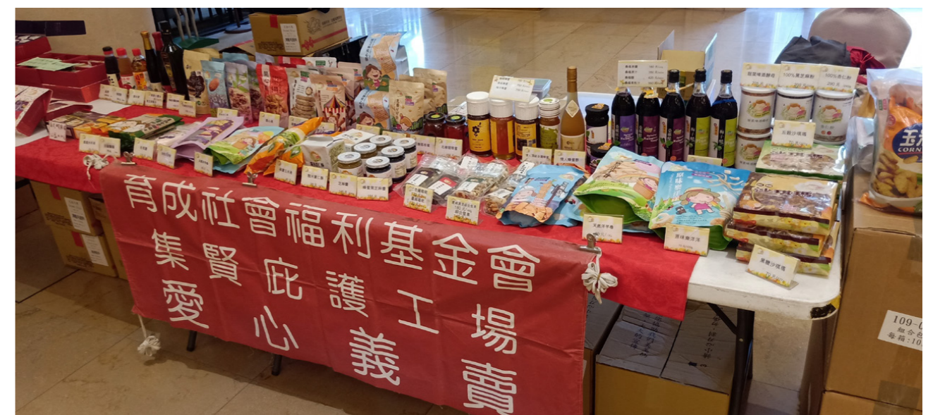
There were lots of product for sale at Yu-Cheng Social Welfare Foundation's booth.