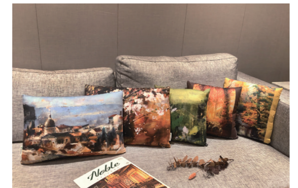
Cushions for charity.