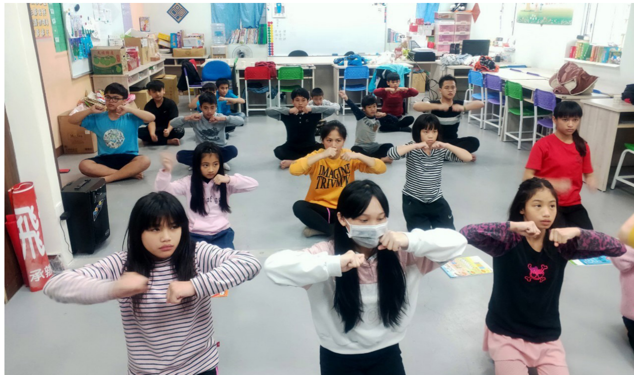
A dance class at Let Love Fly's program in Hualien.

Co-organized by | Cathay United Foundation