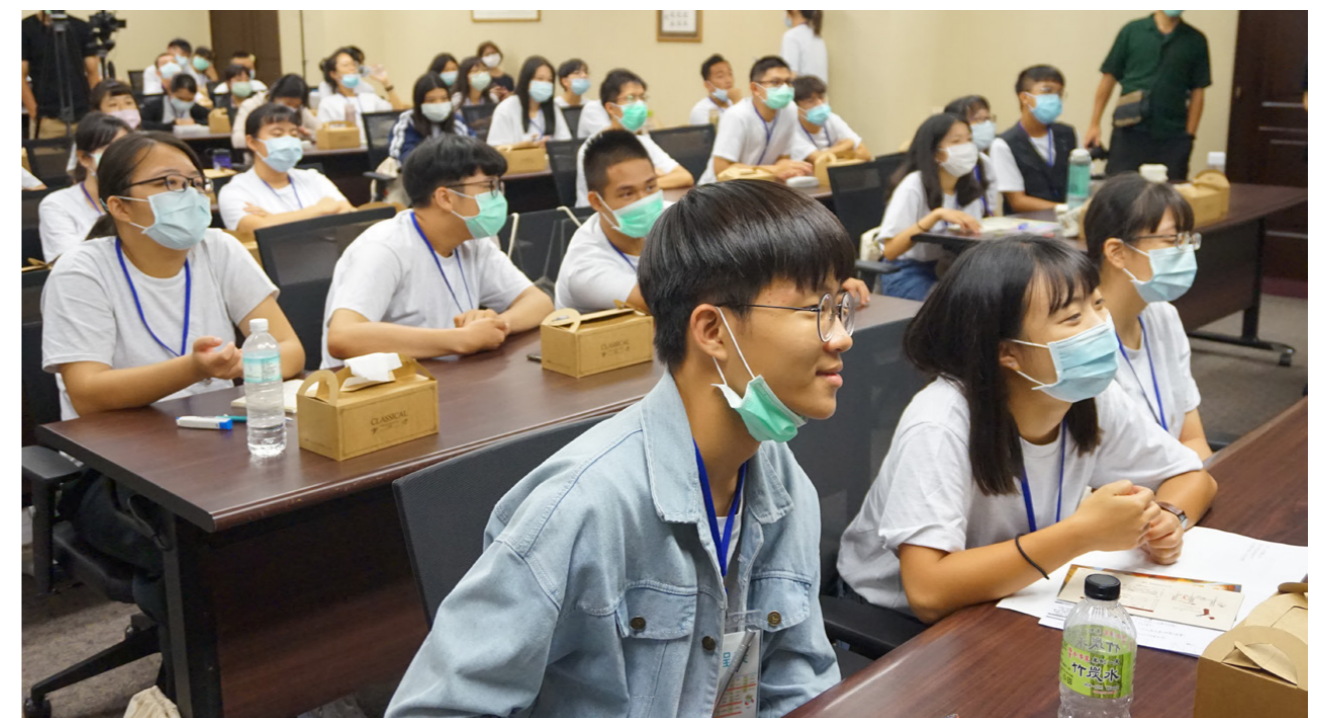
Students showed great interest in corporate international development and overseas living. They had lots of interaction with the instructor.

Organized by | Cathay Charity Foundation