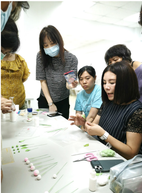
An instructor was teaching how to use resin clay to make berries. (Mingren Library)

Each year Lin Yuan Libraries provide a great variety of in-library talent courses fitting different age groups in resin clay, wool felting, baking, children's art, animal and ecology and so on. These courses have brought new inspirations to people and have enriched people's social life. Parents and children can come together. Participants have the opportunities to enjoy good food, make the full use of parent and children moment, play their creativity and have much fun together. These courses have brought colors to people's life.