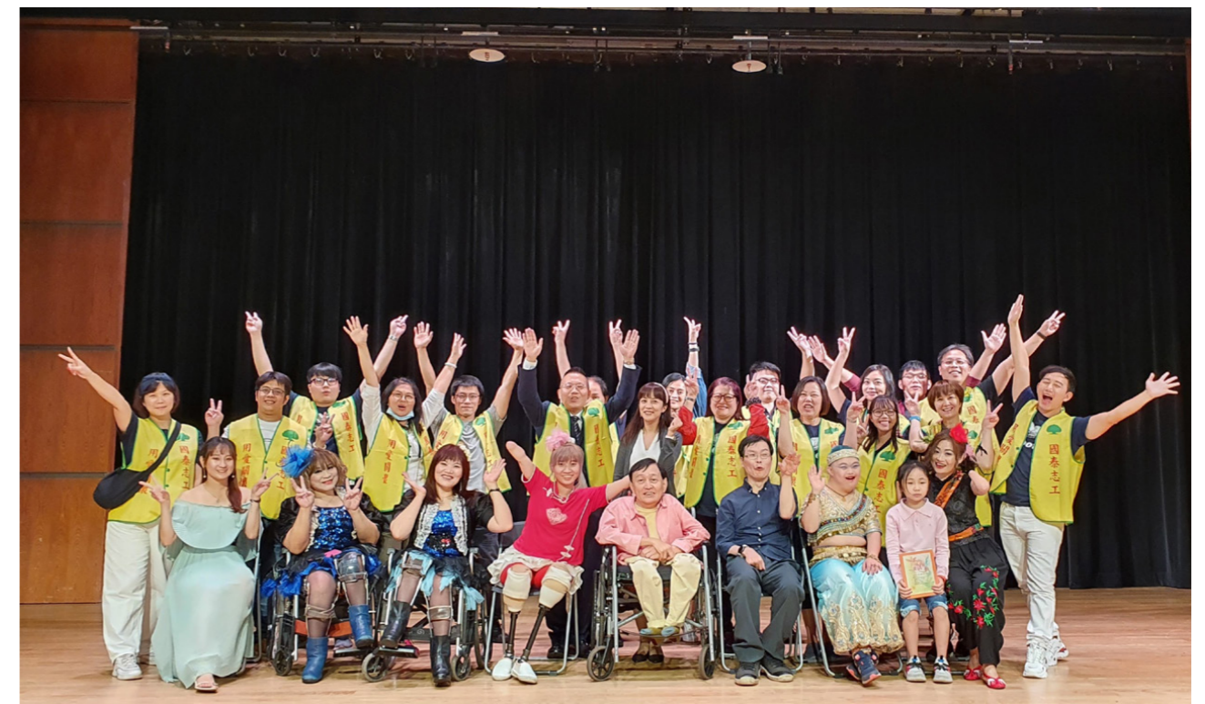
Mixed Disabled Troupe delivered life education through performance.