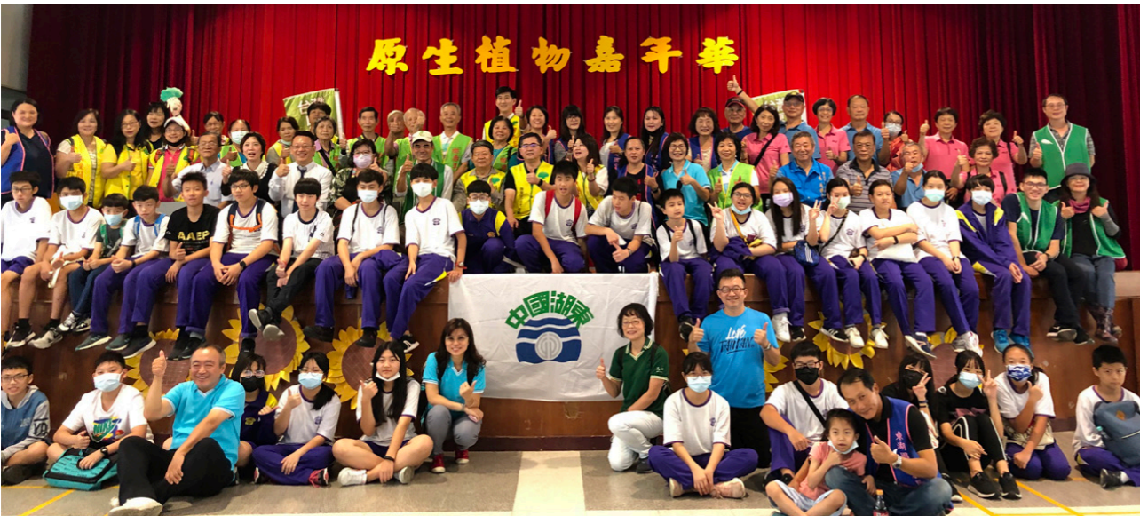
The 2020 Native Tree Planting Festival at Donghu Junior High School

Organized by | Cathay Charity Foundation