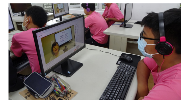
At "Cathay's Career Story House: Bankers", a participant commented, "Now I know things about money can be very professional".

mitment and vision to supporting the lives in the remote country. We will disseminate these beautiful Dream Come True stories and enlarge their influence on social media for better employee engagement. Going forward, Cathay employees will also share the sense of happiness and they will also increase their focus, participation and passion about charity so that the corporate vision will be fulfilled and extended.