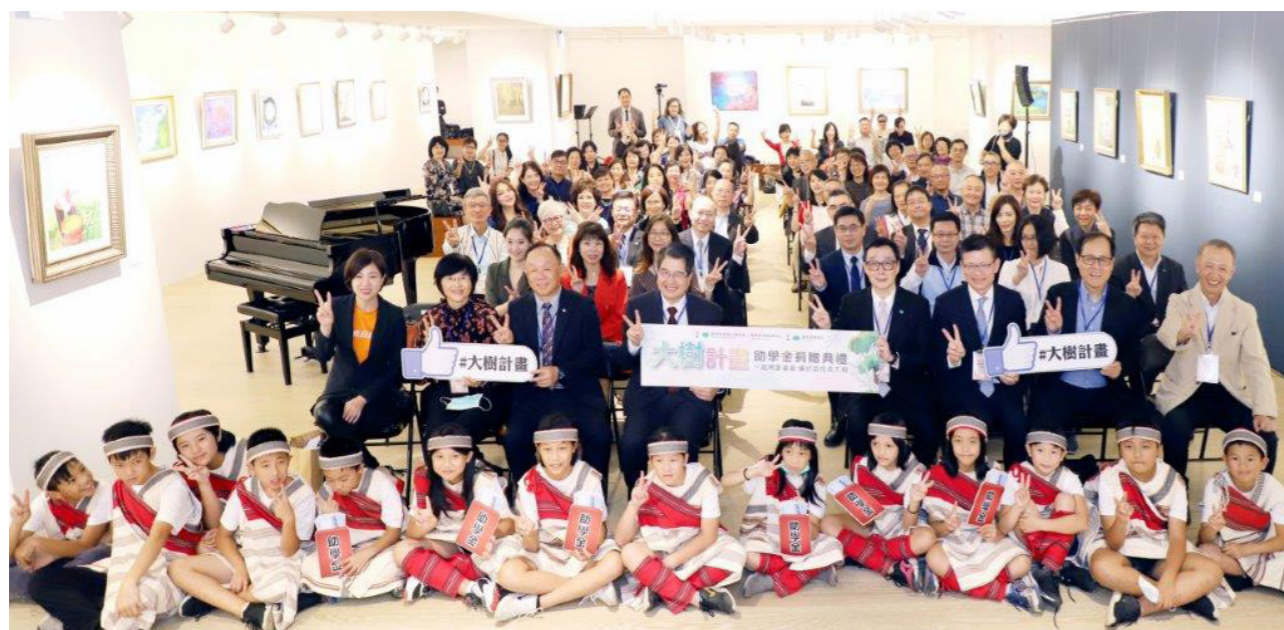
A group photo at the Donation Ceremony for Elevated Tree Program on Oct. 7.

review, and the funds would be appropriated after the approval by the Educational Departments of local governments. These funds would be allocated to the students who are in real needs for them to go to school without worries.