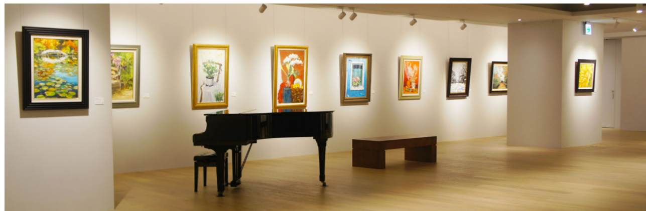
A scene from 2020 Elevated Tree Program-Charitable Painters Exhibition (Pre-launch).

Organized by | Cathay United Bank Foundation Affiliate Art Center