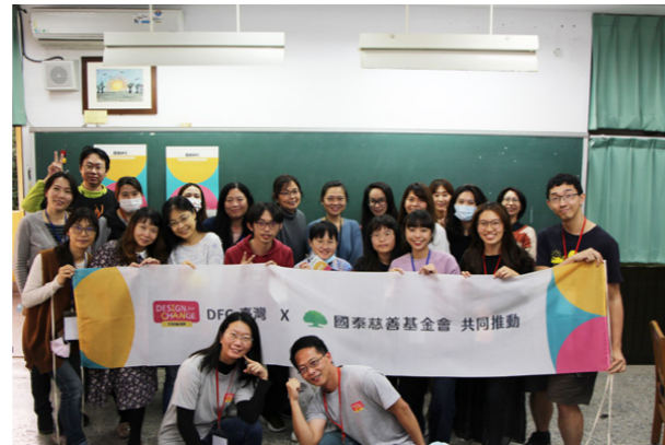
DFC's certified seed teachers held workshops at Chupei Elementary School.

The Crown Beach Empowerment Project for 2nd-G Immigrants was a project initiated by the Educational Bureau of New Taipei City and New Taipei City Culture Foundation to work with 10 schools (i.e. Jinshan Senior High School, Yeliu Elementary School, Wanli Junior High School, Laomei Elementary School, Shimen Elementary School, Shuanxi Senior High School, Mudan Elementary School,