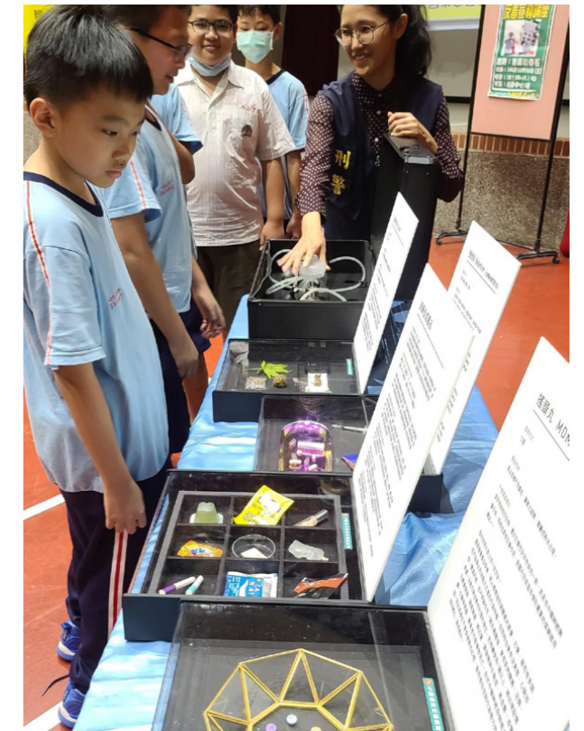
At Crime Investigation's booth, officers were teaching students about the types of drugs and their hazards.

As a response to anti-drug campaign in schools, Cathay Charity Foundation provided sponsorships to Folk Culture Association and invited the professional aerobic performance group, Han Dong Art, to launch anti-drug performance tour at five schools including Jinshan Senior High School, Shuanxi Senior High School, Juifang Industrial High School, Luzhou Junior High School and Pinglin Junior High School, benefiting 2,930 students. The Foundation also worked with Criminal Investigation Bureau for the first time. They set up a booth demonstrating and explaining drugs for students and promoted the awareness of anti-drug, anti-crime and anti-bullying.