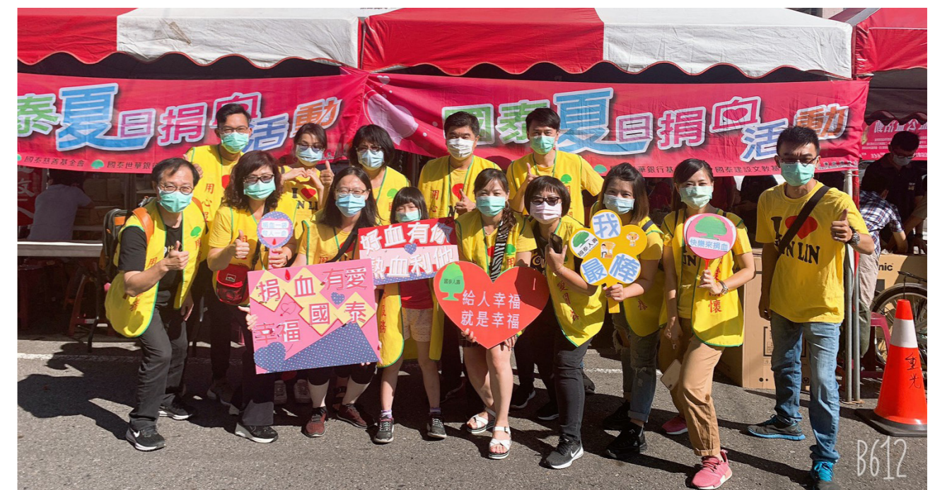
Yunlin Branch of Cathay Life Insurance supported the blood donation campaign.

Over these 21 years, Cathay made a record of collecting over 30,000 bags of blood five years in a row, and received recognition from Taiwan Blood Services Foundation for 18 consecutive years. Blood donation has become the DNA for each Cathay people. Cathay is committed to its social responsibility and gives back to the society by integrating resources around the Group.