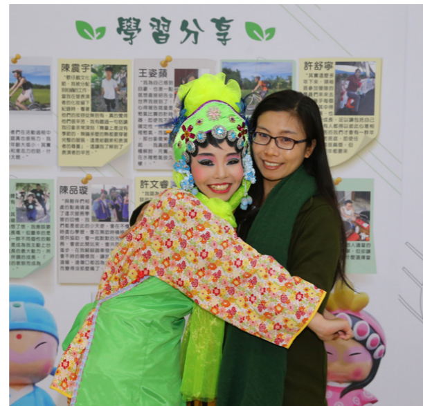
A girl playing a heroine role took photos with her mother. She expressed her gratitude to the Dedicated Empowerment Program where she completed a lot of challenges.

social welfare and education to build an inclusive society where diverse cultures blossom.